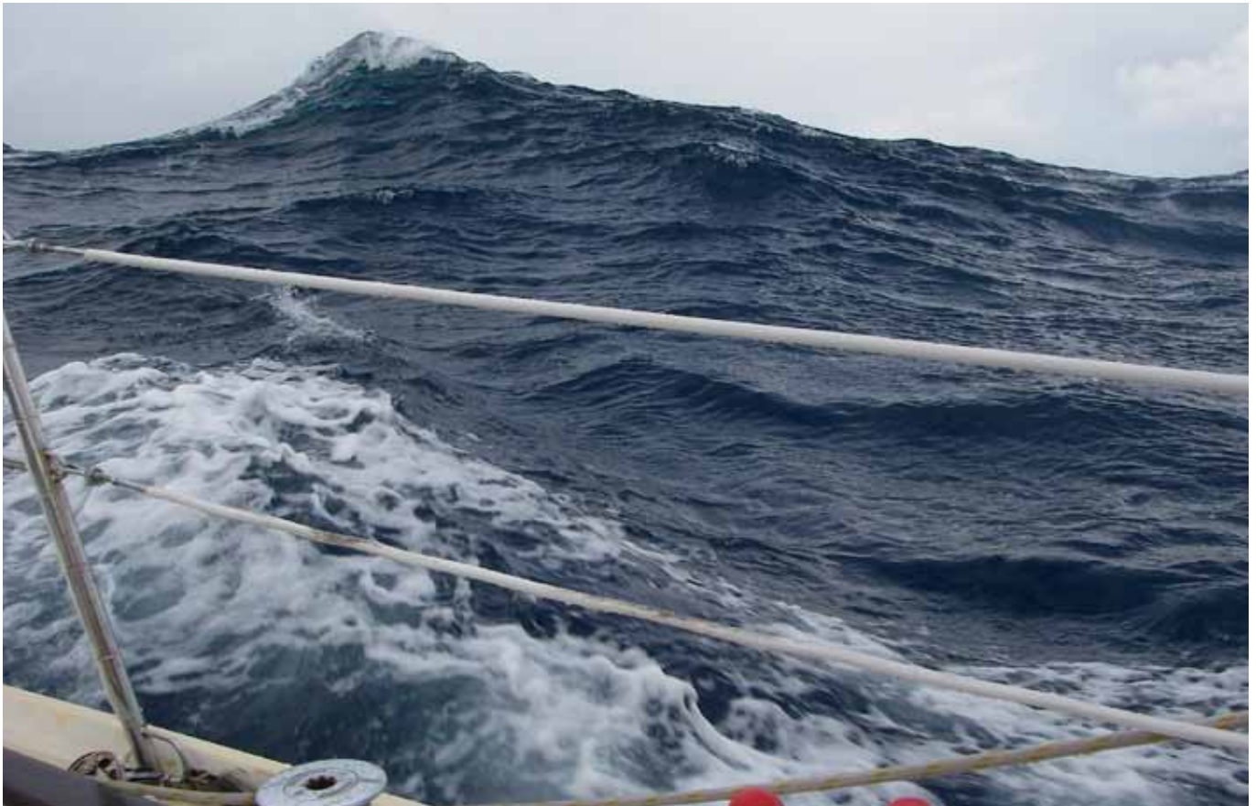
Waves are bigger in the Tasman!