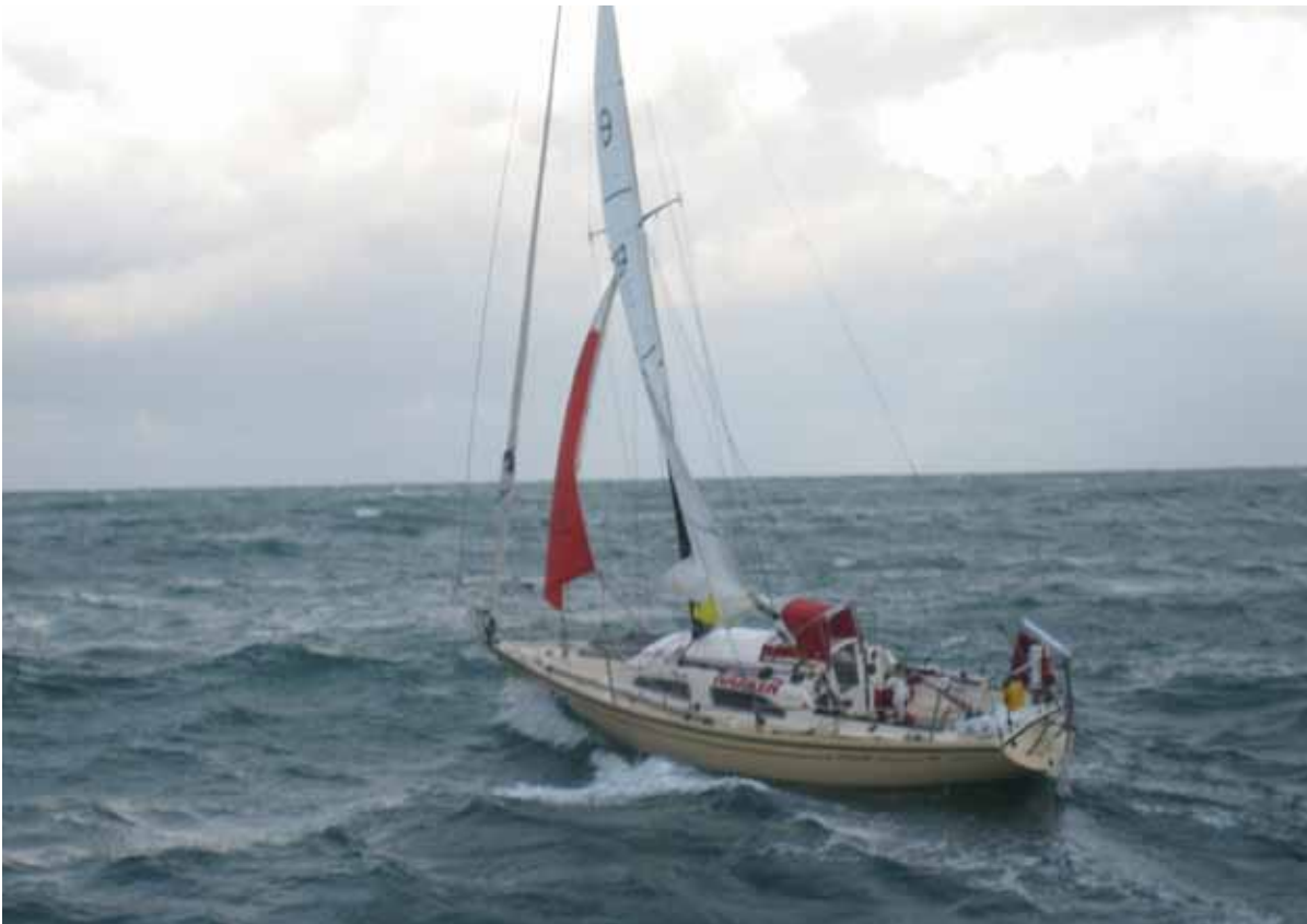
Wishbone crosses the finish line at Mooloolaba.