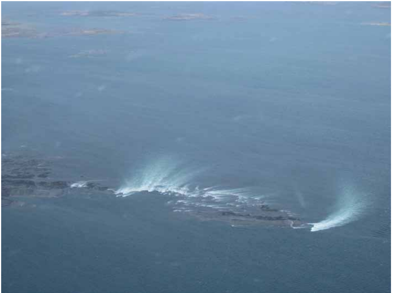
One of the many tide races David flew over in Ungava Bay.

There is now rivalry between these two tidal regions because as any avid kayaker knows, it's all about bragging rights.