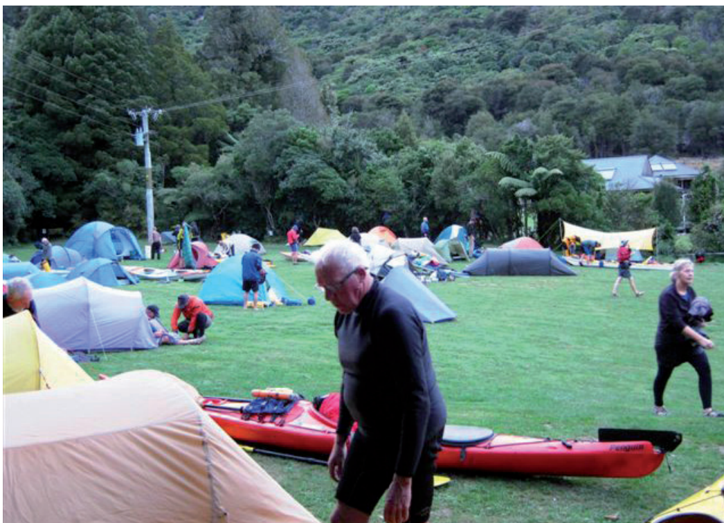
Setting up camp at Mistletoe Bay.

Look up the website www.kask.org.nz , to become a member and receive The Sea Canoeist Newsletter.