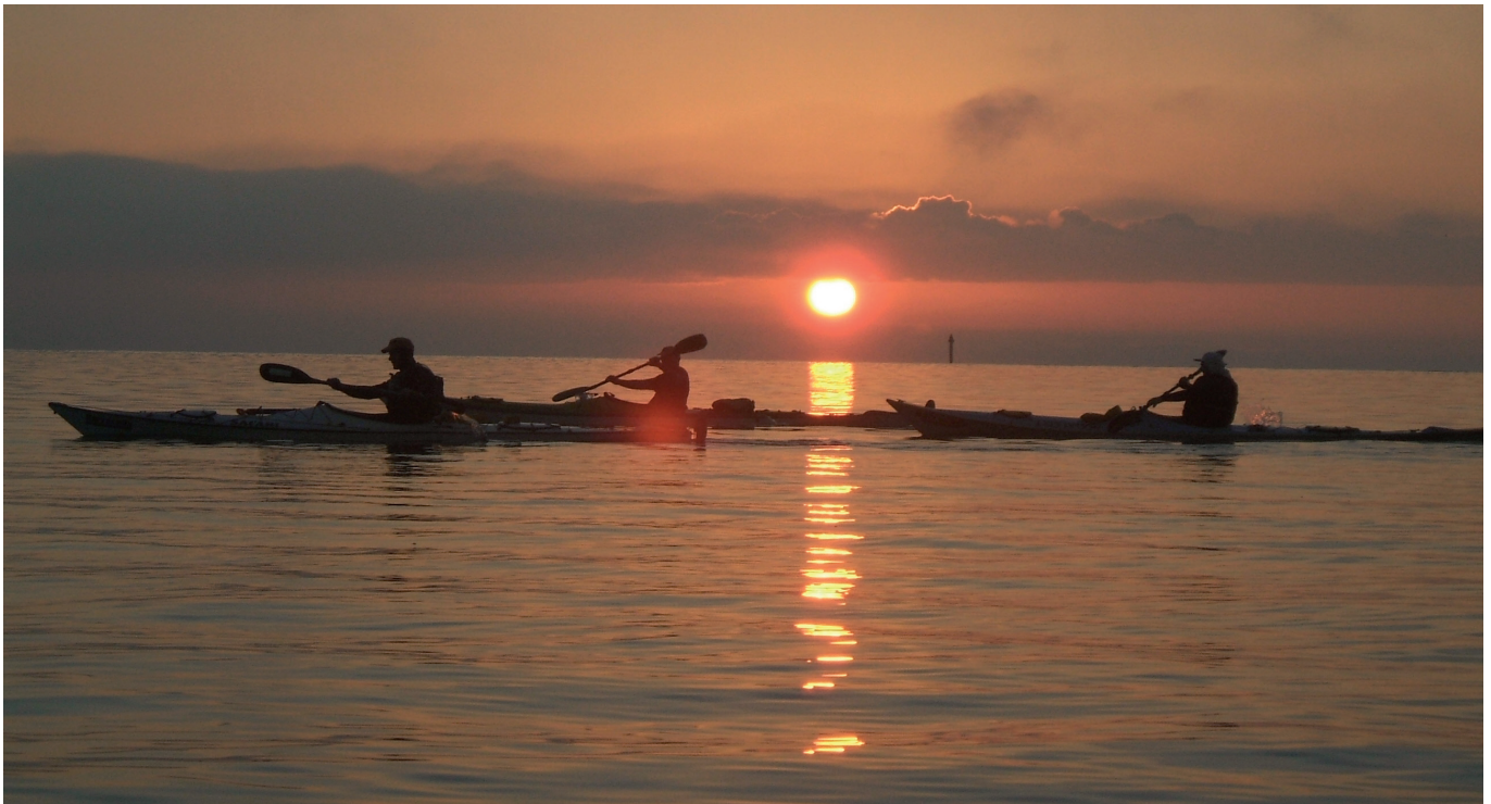
Off on another adventure.