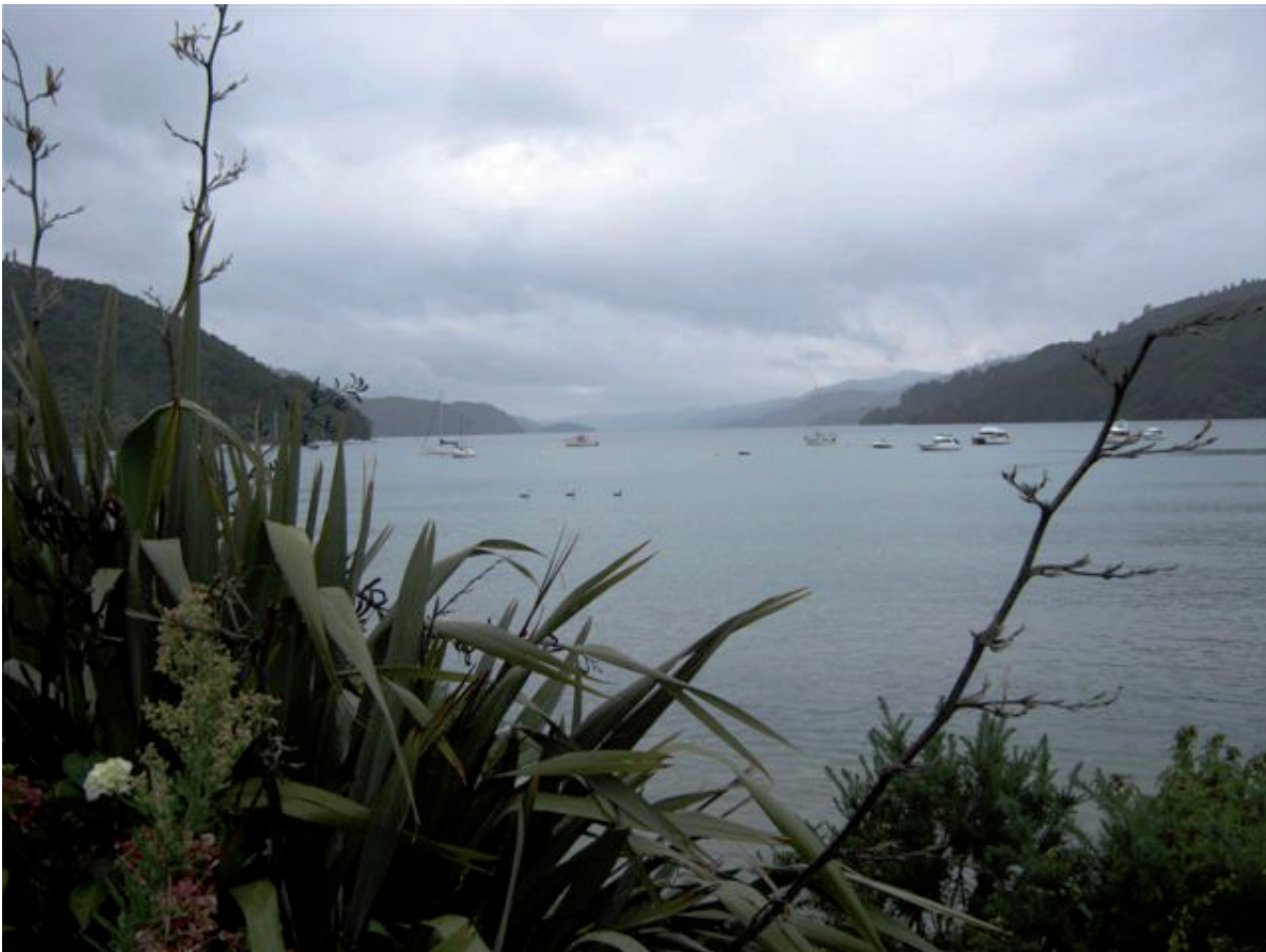
Anakiwa, Queen Charlotte Sound. See KASK report on page 5.

The Auckland Canoe Club Annual General Meeting will be held on Tuesday 17 May at the Marine Rescue Centre on Tamaki Drive. Meet at 7.00 pm for a 7.30 start.